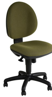
MANAGERIAL SWIVEL CHAIR