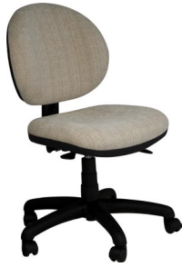
MEDIUM SWIVEL TASK

The Ergomek Series task chair is available in medium and managerial sizes. Medium size chairs or Ergomek I are available with adjustable T arms and hi-kits. Managerial chairs or Ergomek II are available with loop arms or adjustable loop arms. Outstanding quality and comfort makes the Ergomek a perfect choice for any office environment.