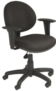
MEDIUM SWIVEL WITH ARMS