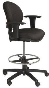
MEDIUM BACK SWIVEL W/ARMS, HIGH CHAIR KIT