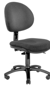
MEDIUM SWIVEL TASK CHAIR