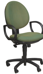
MANAGERIAL SWIVEL WITH LOOP ARMS