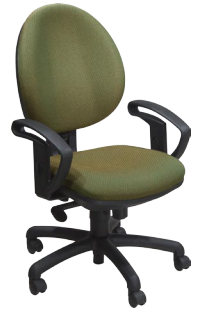
MANAGERIAL SWIVEL WITH ADJUSTABLE ARMS