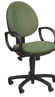
MANAGERIAL CHAIR WITH LOOP ARMS